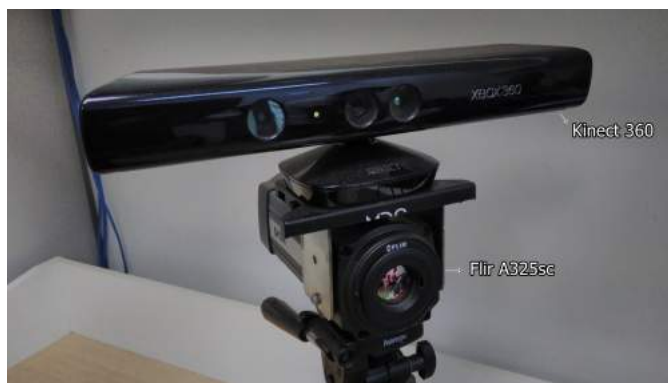
Fig. 2. Multimodal system of a thermal camera FLIR A325sc and an RGB-D camera Microsoft Kinect 360.

The software used for camera system connection are: ResearchIR (native FLIR software for images acquisition and display), MATLAB R2016a (high-performance development environment for numerical activities and software prototypes), and Kinect SDK 1.8. The multimodal system and the calibration method for the cameras capture the RGB-D-T images in order to map the areas which match. With that, it is possible