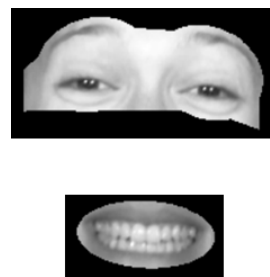
Fig. 2. Regions of Interest (ROI)

For this work, it was also necessary to convert the original color images into grayscale as well as to extract the regions of interest (ROI) shown in Figure 2. We chose to work with the regions of the mouth and the eyes because they are considered more significant to detect emotions [14].